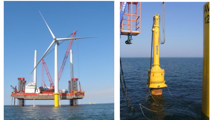
Offshore pile driving by means of the hydraulic MENCK hammer.

High noise levels are easily accessed through this simulation. Hence appropriate noise protection systems can be developed such enclosing the pile in a "bubble curtain" or an auxiliary pile with air cambers, treatment of the pile surface or other solutions.